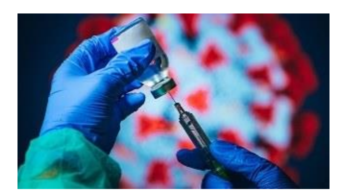
UA COVID-19 Vaccine Clinic through the UA Primary Prevention Mobile Health Unit <a href="https://www.signupgenius.com/go/30e0449acab2da6f94-uamhucovid192">https://www.signupgenius.com/go/30e0449acab2da6f94-uamhucovid192</a>